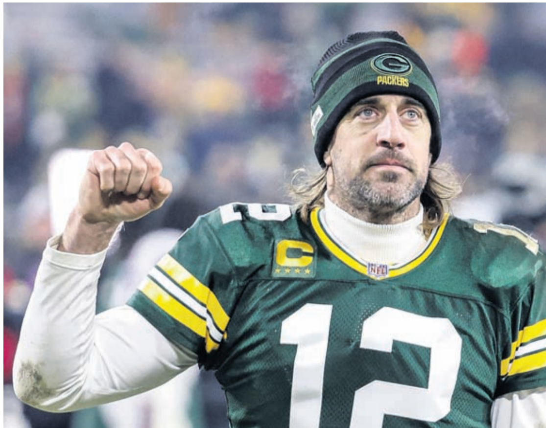
Green Bay Packers quarterback Aaron Rodgers (12) reacts as he leaves the field after an NFL game against the Minnesota Vikings on Sunday, Jan. 2, 2022, in Green Bay, Wis.